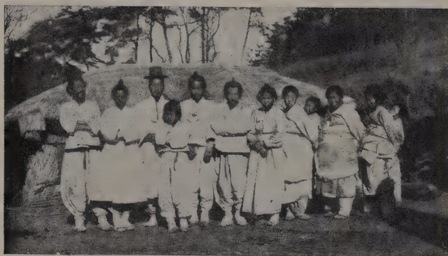
SOME VILLAGE CHRISTIANS